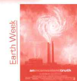
An Inconvenient Truth Film Festival III