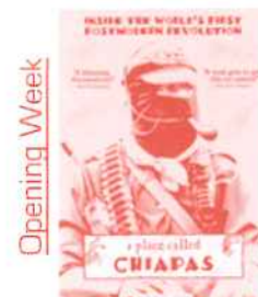
A Place Called Chiapas Film Festival I