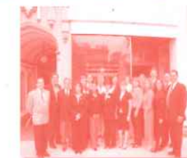
Prudential California Real Estate PruLatino