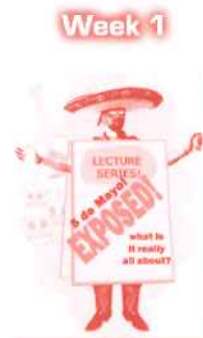
5 de Mayo: Exposed!