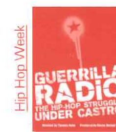
Guerrilla Radio: The Hip Hop Struggle Under Castro Film Festival IV