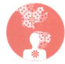
World Health Day