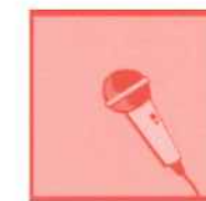
Open Mic Night